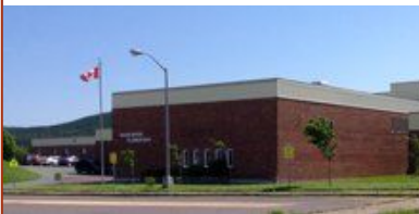
Hazelwood Elementary (K-6)