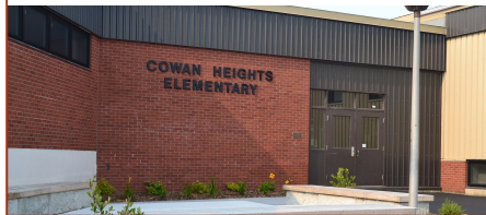
Cowan Heights Elementary (K-7)