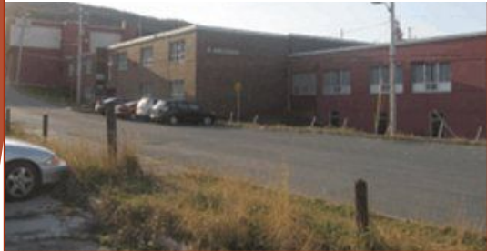
St. John Bosco (K-9)