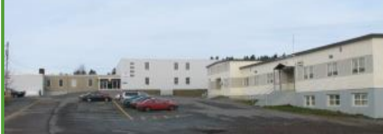
Point Leamington Academy