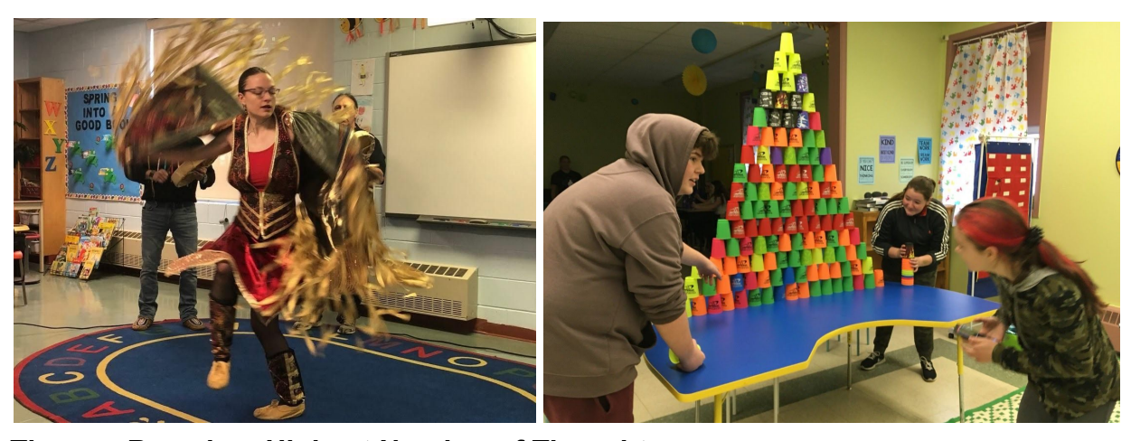
Themes Based on Highest Number of Thoughts

Themes in this chart are rated highest to lowest based on star ratings. The highest star rated thoughts were those that are outside of the District's authority or mandate, and are categorized as such throughout this document. These include comments made with respect to reduced class size or decreased student-teacher ratios, increased human resources (e.g., administration, guidance counsellors, teachers, instructional resource teachers, student assistants) and cannot therefore be directly included in the Board's Strategic Plan. The lowest rated thoughts were noted under 'other', and include thoughts on collaboration and more preparation time for teachers. Details on each theme area are discussed under Themes.