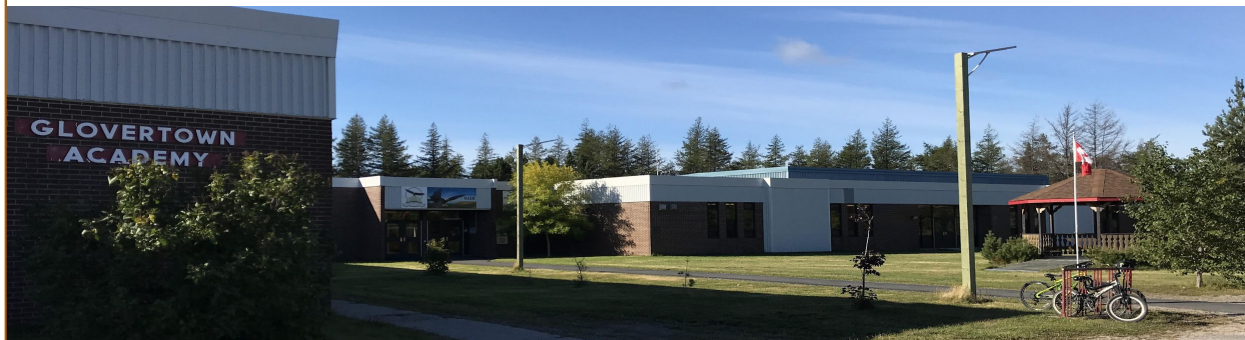
Glovertown Academy (K-12)