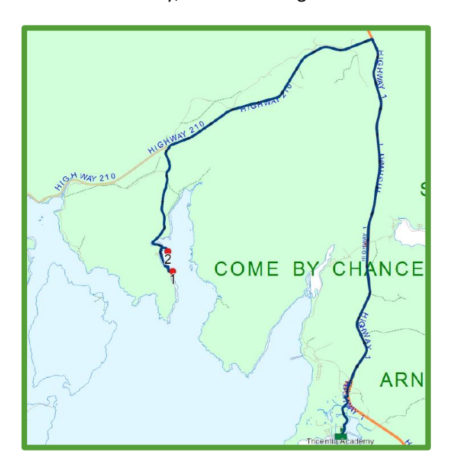
Figure 6: Private vehicle route from North Harbour to Tricentia Academy

The second private vehicle route would begin in North Harbour and proceed to highway 210 and on to Tricentia Academy, as shown in figure 6 below.