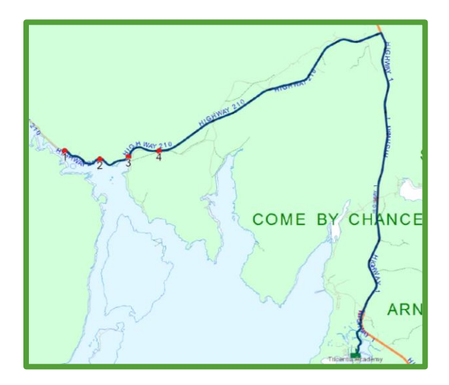
Figure 4: Mini-bus route from Swift Current to Tricentia Academy

The bus route would begin at the far end of Swift Current and proceed through town on to Tricentia Academy, as shown in figure 4 below.