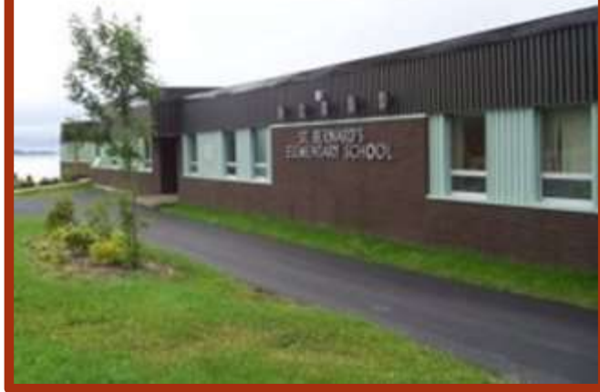
St. Bernard's Elementary